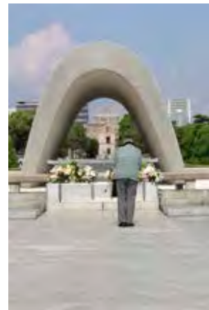
Hiroshima, Japan

A wish for you And a wish for the world -- Love, hope, peace and beauty."