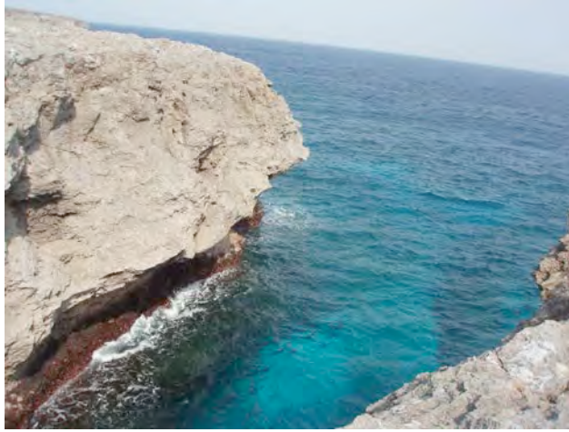
Okinawa, Japan 2011

A country that cherishes Harmony and Respect.