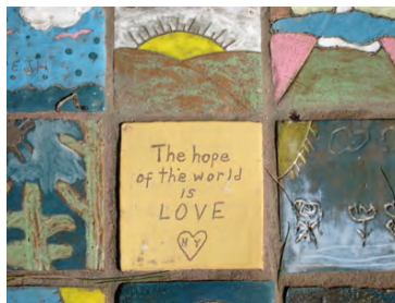
Peace Pilgrim Park, Egg Harbor City, New Jersey, USA