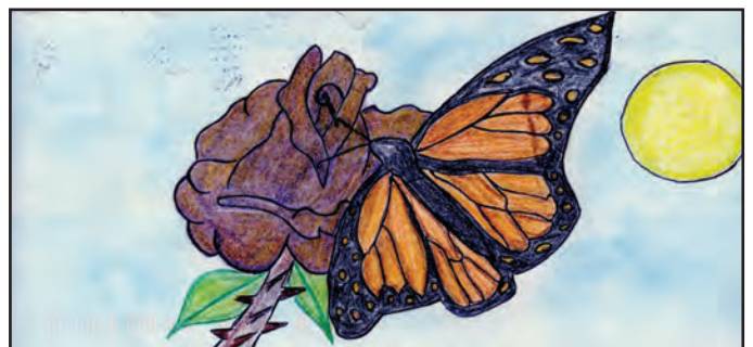
Drawing on an envelope received from a prisoner in Texas.