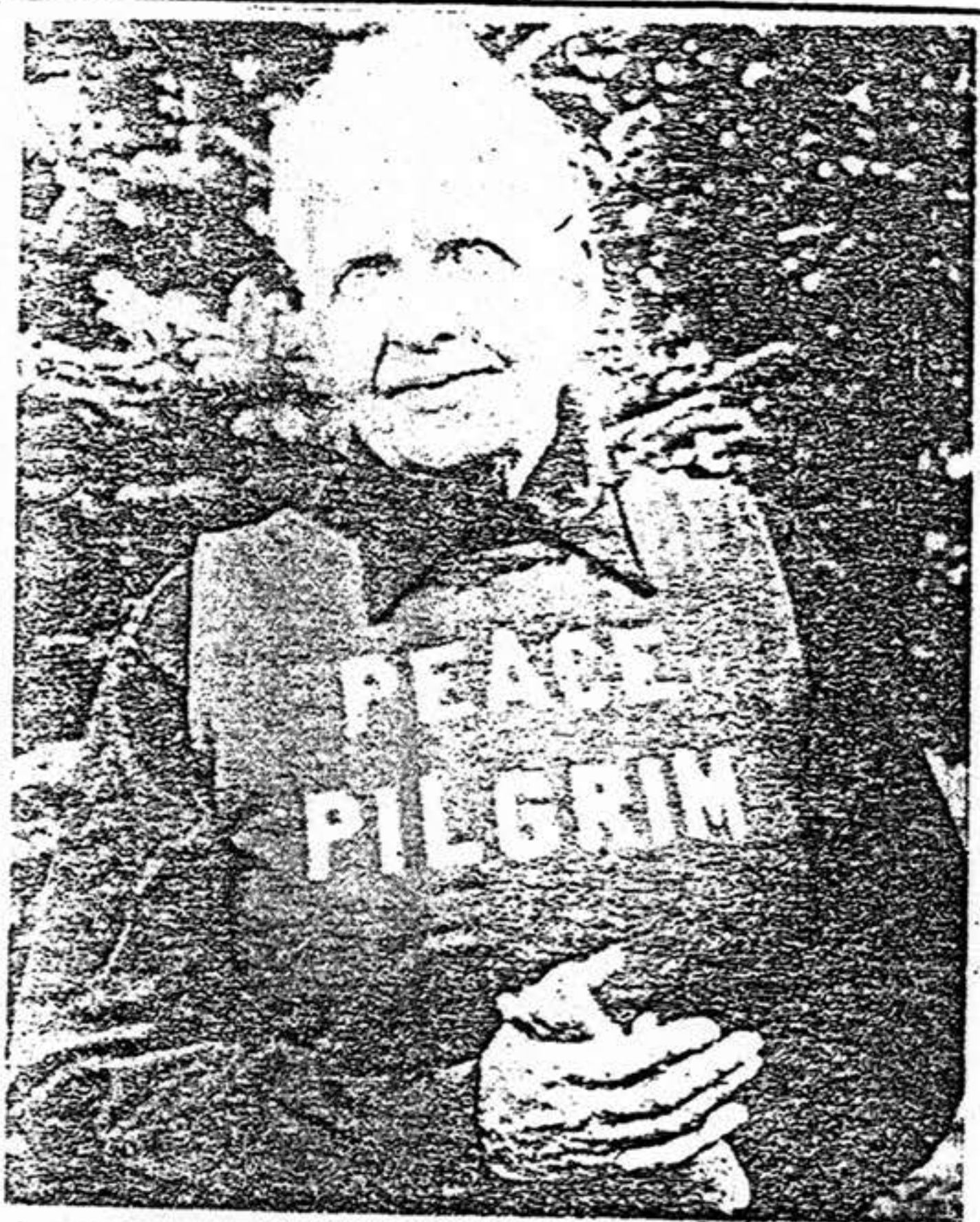
MILDRED NORMAN . . . the 'peace pilgrim'